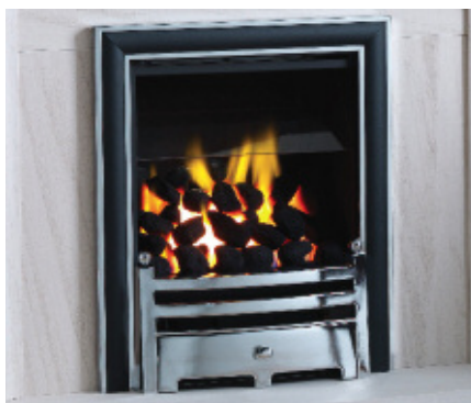
Paragon P3 Hybrid Elite trim & Gate fret in chrome