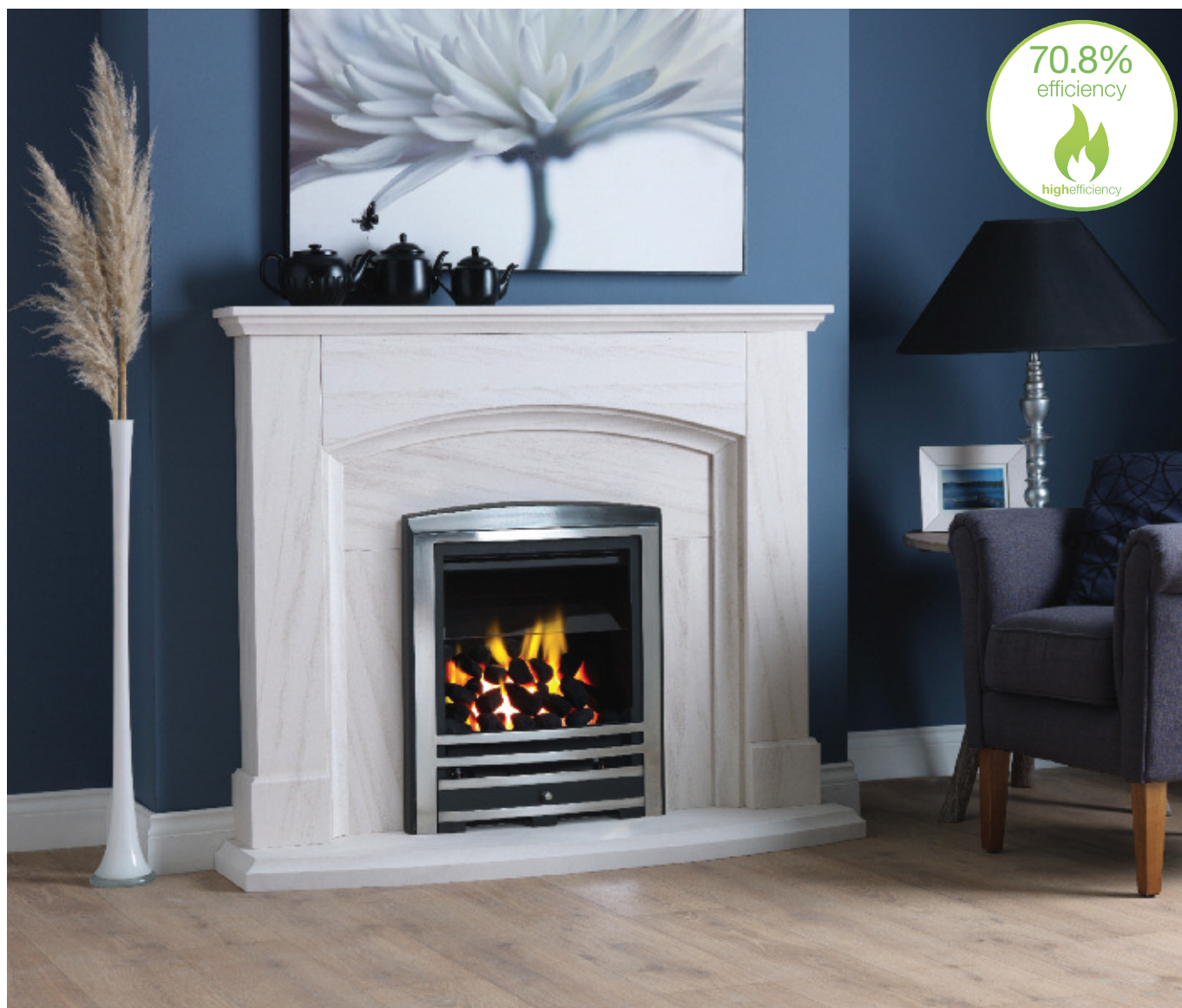
Paragon P3 Hybrid with Cast Arch fascia in chrome

For specifications refer to the technical datasheet