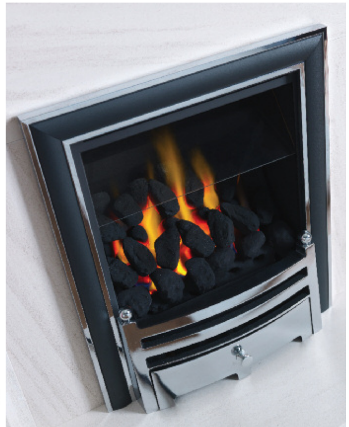
Paragon P3 Hybrid Elite Trim & Gate Fret in Chrome