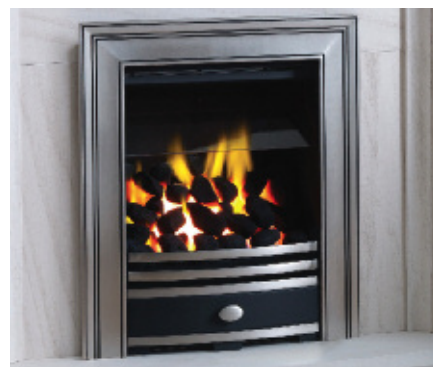
Paragon P3 Hybrid with Square fascia in pewter