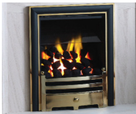
Paragon P3 Hybrid Elite trim & Gate fret in brass

The Paragon P3 Hybrid Series is a natural gas, manual control, convector gas fire combining the performance of a highly-efficient glass-fronted fire with the charm of an open-flame gas fire.